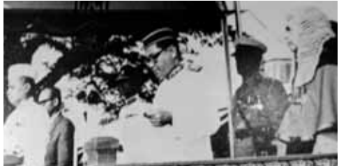
Malaysia was formed in 1963