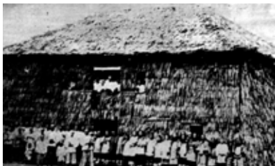
Sing Ang Tong, the first church set up by the Methodist congregation in Sibuan