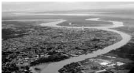
Rajang River, the longest river in Malaysia