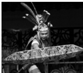
26 ethnic groups in Sarawak

as the Full Gospel Church (established in 1982). In recent years, more churches such as the Blessed Church, City Harvest Church, Living Water Church and Bread of Life Christian Church were set up.