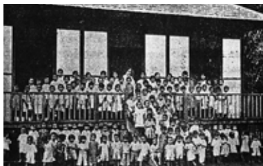
Methodist Girl's School, the first girl school in Sibuluh